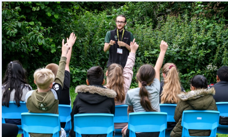
Learning Through Landscapes - Heatherbrook Primary Academy, Leicester. July 2021.

This partnership exemplifies how collaborative funding can create meaningful, lasting impact, helping children connect with nature and enhancing outdoor education across the country.